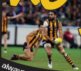
always wash your hands